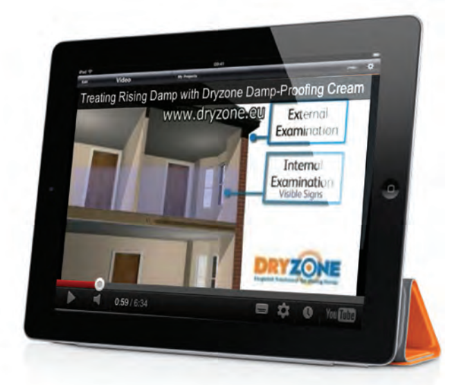
Visit www.dryzone.eu to view the Dryzone video.