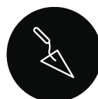
Damp Proof Course