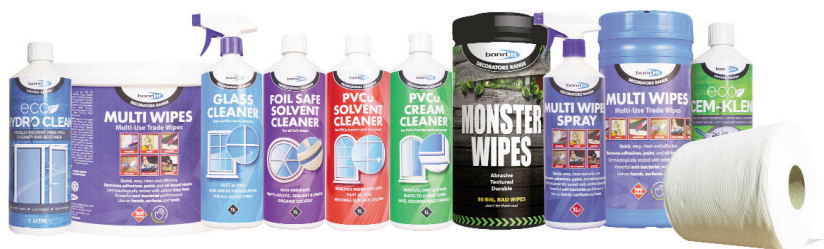
Part of the Bond It Professional Cleaning Range

The data presented in this leaflet are in accordance with the present state of our knowledge, but do not absolve the user from carefully checking all supplies immediately on receipt. We reserve the right to alter product constants within the scope of technical progress or new developments. The recommendations made in this leaflet should be checked by preliminary trials because of conditions during processing over which we have no control, especially where other companies raw materials are also being used. The recommendations do not absolve the user from the obligation of investigating the possibility of infringement of third parties rights and, if necessary clarifying the position. Recommendations for use do not constitute a warranty, either expressed or implied, of the fitness or suitability of the products for a particular purpose.